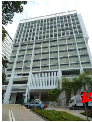
Knowles Building and LE 鈕魯詩樓

Assemble for transportation by 18:00, 7 Dec, 2015 outside Library Extension (LE)