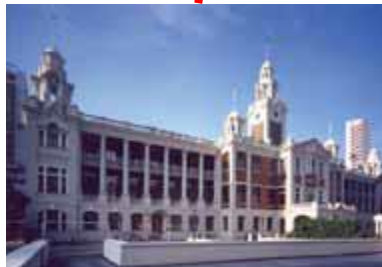
Main Building & Loke Yew Hall 本部大樓及陸佑堂