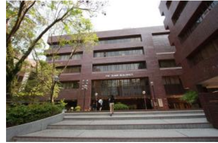
Run Run Shaw Building 邵逸夫樓

Assemble for transportation by 18:00, 7 Dec, 2015 outside Library Extension (LE)