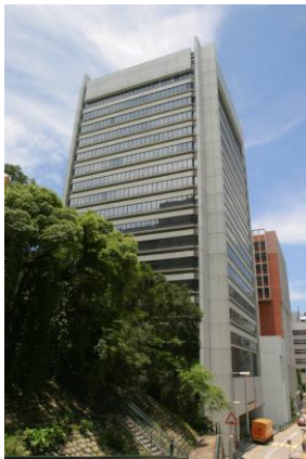
K.K. Leung Building 梁銶琚樓