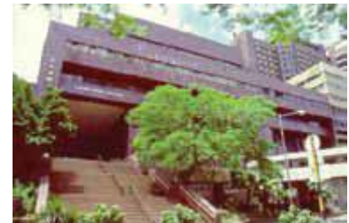
West Gate Pokfulam Road Entrance 西閘薄扶林道入口