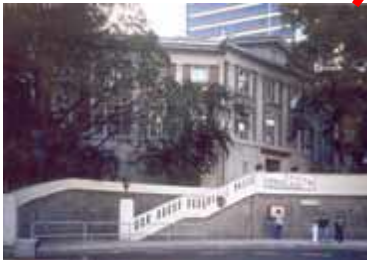
East Gate Bonham Road Entrance 東閘般咸道入口